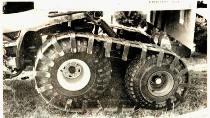
Tracks wrap around rear wheels and add-on bogey wheel.

For more information, contact: FARM SHOW Followup, Cambridge Metal and Plastics, 200 South Cleveland, Cambridge, Minn. 55088 (ph 612 689-4800).