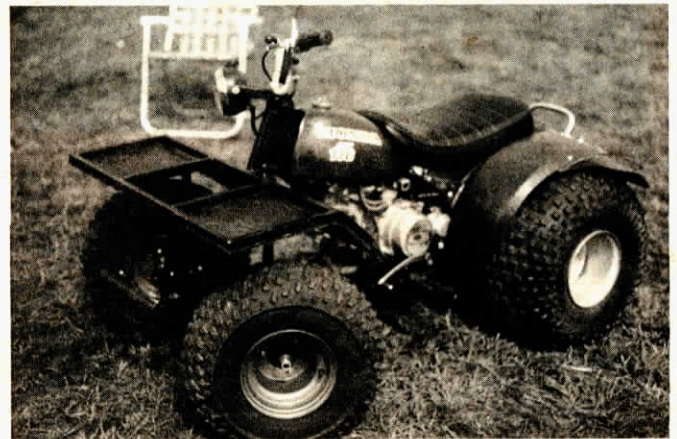
Add-on front axle assembly simply bolts into place with no welding or cutting.

For more information, contact: FARM SHOW Followup, Louis Niday, Specialty Products Sales Inc., Box 503, Humeston, Iowa 50123 (ph 515 774-2010 or 877-3141).