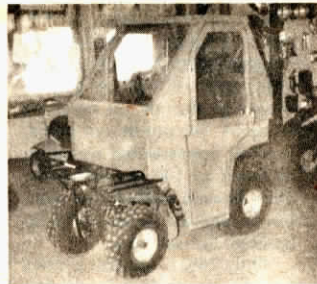
Roomy cab is fitted with large, non-breakable windrows.

Orange-colored "Winter Covers" are available to fit Suzuki 125, 185 and 250 machines, Honda 250's and most other 4-wheel models.