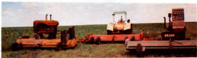
Goering ganged 3 flail-type shredders together. Center one is powered by tractor pto.