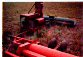
Right hand mower is powered by Chrysler engine off Massey 92 combine.