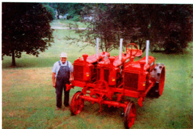
Lee mounted three Farmall F-30's together on a frame with a single front axle and a single set of rear wheels.