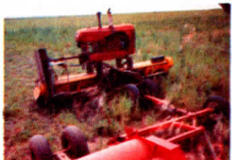
Left hand mower has front end of Massey 44 tractor mounted on top of it.