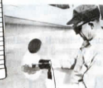
Strips an entire boat faster, easier than any other way.

USE IT TO PEEL PAINT, THAW FROZEN PIPES, WARM ENGINES, SWEAT COPPER FITTINGS