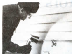
Instantly thaws out frozen pipes.