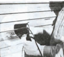
Zaps paint off house siding, furniture.