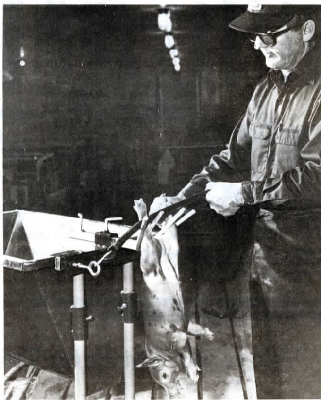
Holder can be fastened to farrowing crate, feed cart, or most anyplace.

For more details, contact: FARM SHOW Followup, The John Sturges House, 49 Riverside Ave., Westport, Conn. 06880 (ph. 203 227-7216).