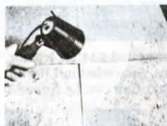
Softens tile for easy laying on irregular concrete floors.