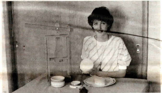
Hoogmoed says it takes 2½ hrs. to make Dutch Gouda cheese.

For more details, contact: FARM SHOW Followup, Duro-Test Bulbs, Donald E. Haugen, 416 Fire Tree Lane, Ofallon, Mo. 63366 (ph toll free 800 323-2587).