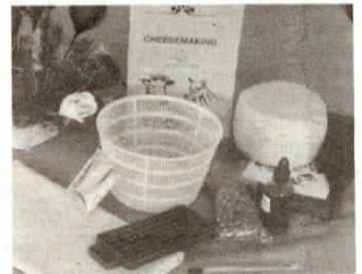
With kit, you can make cheese from cow, goat or sheep milk.

Hoogmoed says cheese recipes are easy to follow. "It takes about 2½ hrs. from start to finish to make Dutch Gouda cheese. Pressing takes 3 to 5 hrs. Then you store the cheese for about 3 weeks to let it ripen," she