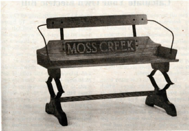
Authentically-styled oak or pine bench can have personalized message put on back.