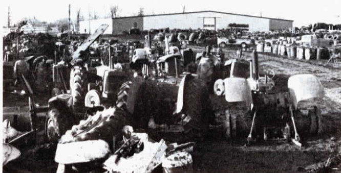
At Worthington Tractor Salvage, Inc., most tractors are stripped and the parts taken inside, cleaned and stocked for resale.

Because of frequent model updates, used combine parts are more difficult to track down, says Dyke.