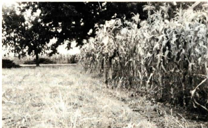
Juhnke says his 17-ft. tall silage corn produces twice the tonnage per acre as conventional varieties.