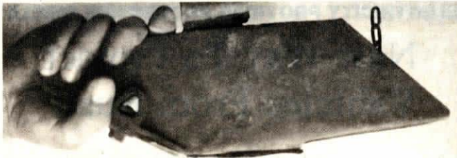
Wedge-shaped point welds to bottom edge of shoe.

"Nearly 80% of all commercial seeds are now hybrids. We're in danger of losing much of our genetic diversity in this country," says Earle, who's a member of Seed Saver's Exchange, headquartered in De-