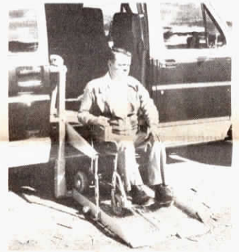
Wheelchair lift enables the driver to get into his vehicle, drive to his destination and get out again without assistance.

The lift can be bought separate or installed. Cost of the semi-automatic