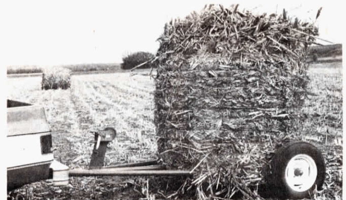
Bale mover lifts, loads and transports round bales up to 2,000 lbs.

To use, you just position bale mover against bale (above) so spike can be inserted into bale. Bale then moves onto trailer as you wind winch to retract the cable. By locking winch drum, bale is ready for transport.