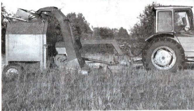
Chopper blows forage directly into baler's top-loading chamber.