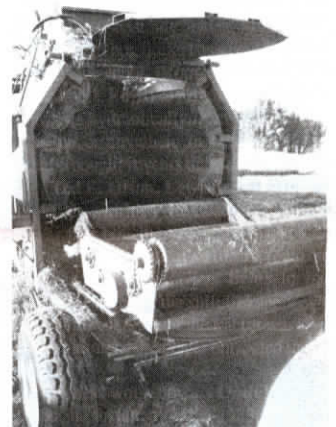
Entire roller assembly rotates to wrap bale and then pivots backward to drop bale on ground.