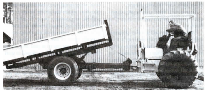
Loaded cargo bed is picked off ground and winched onto tractor frame. Note in bottom photo how axle is moved forward to position wheels under the cargo bed.