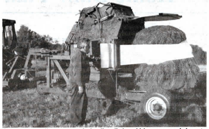
Operator manually operates a hydraulic cylinder which opens rear baler gate. Bottom six-roller bale wrapping unit then slides out, bringing bale with it, and wrapping begins.