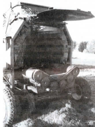
Six bottom rolls slide out hydraulically on built-in axles and convert into bale-wrapping rollers.