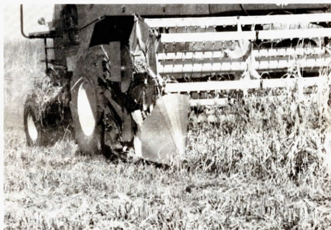
E-Z-Vider on each end of cutterbar guides outside row into header.