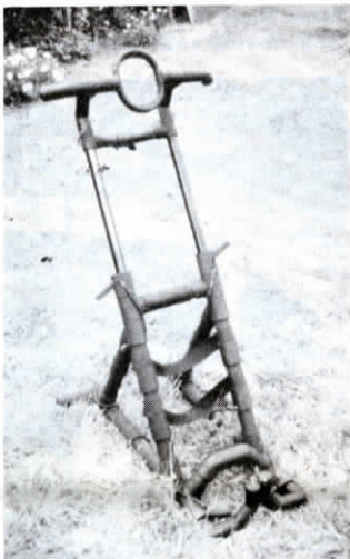
New restrainer, made out of plastic pipe, holds calf's head and legs motionless in a way that causes minimal stress to animal.