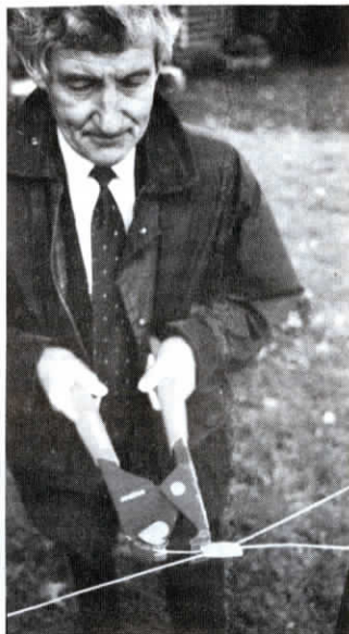
Gripple wire joiner can be used both to splice and tension wire. Tightens in either direction with special hand tool.

The standard Gripple, which fits any wire from 17 ga. to 10-ga., sells for 99 cents