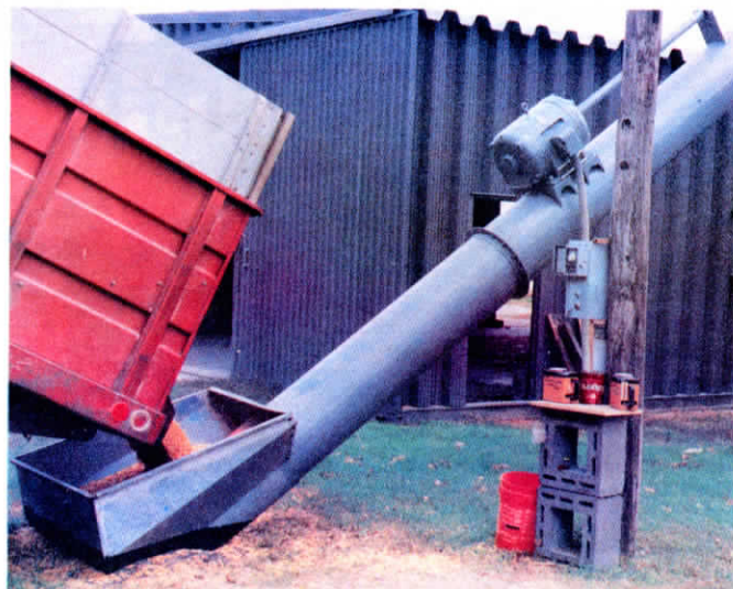
Stationary auger can unload 350-bu. truck full of corn in about 2 min. Grain is moved into 3,000-bu. wet holding bin that feeds continuous flow dryer.

Make check payable to FARM SHOW. Clip and mail this coupon to: FARM SHOW, 20088 Kenwood Trail, P.O. Box 1029, Lakeville, Minn. 55044.