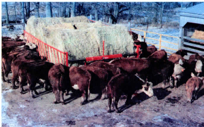
Sides telescope out as wide as 11 ft. or "narrow up" to 5 1/2 ft. as cattle push them inward while feeding.