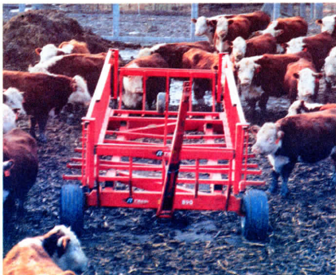
The 22-ft. long hauler/feeder mounts on E-Z Trail wagon gear and can handle eight 5-ft. bales or six 6-ft. bales.

For more information, contact: FARM SHOW Followup, E-Z Trail, Inc., Hwy 133 East, P.O. Box 268, Arthur, Ill. 61911 (ph 217 543-3471).