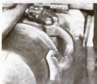
Closeup photo shows detail of pulley brake on John Deere "D" tractor.