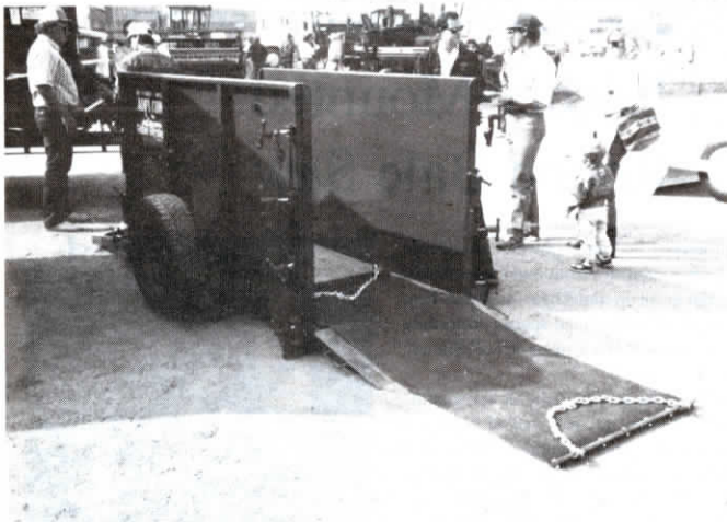
Downed cow is rolled onto rubber mat and pulled into trailer, which is then filled with water to float animal into standing position.