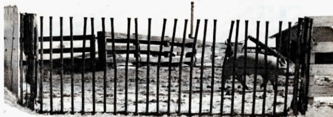
Simply push the Tumble gate over with your tractor or truck and the gate will come back into position on its own power.

For more details, contact: FARM SHOW Followup, Tumble Gate, Portable Welding, H. E. Wooden, President, Route 1, Tiskilwa, Ill. 61368 (ph 815 875-2575).