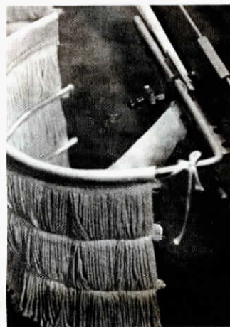
A drip strap beneath each nozzle "catches every drop."