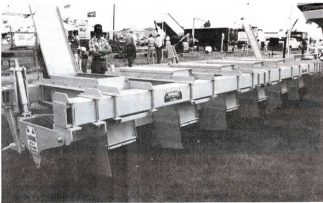
Chopper units positioned over each row chop material into a fine mulch that's spread evenly behind full width of machine.