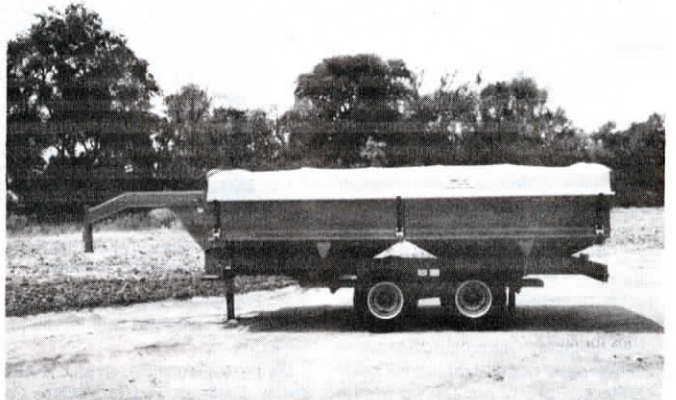
Multiple hoppers let you haul both seed and fertilizer at the same time.

Contact: FARM SHOW Followup, Dawn Equipment Co., 1913 W. Fairview Drive, DeKalb, Ill. 60115 (ph 815 756-1801).