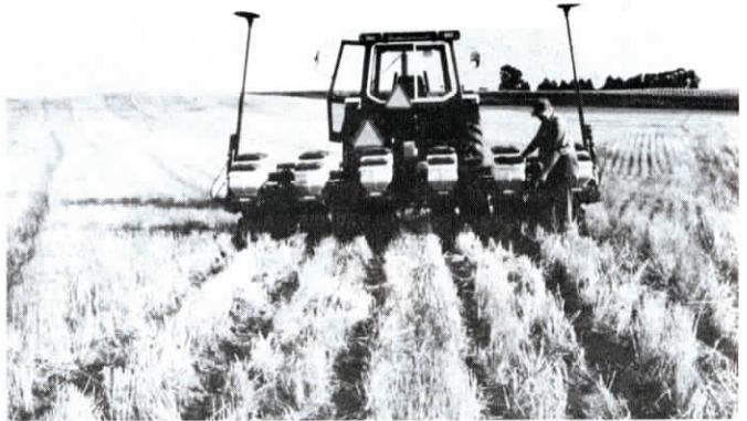
Trash Wheels clear residue in front of each planter opener, creating a garden-like seedbed in heavy residue.

For more information, contact: FARM SHOW Followup, Specialty Machine & Mfg. Inc., 9th & Patton, P.O. Box 85, Great Bend, Kan. 67530 (ph 316 793-5467).