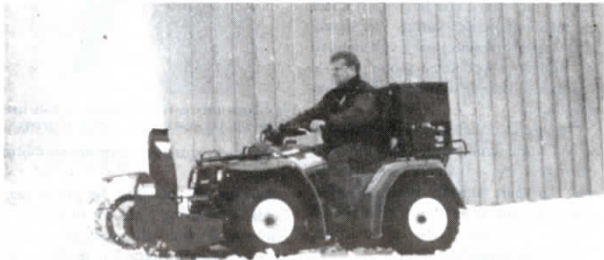
Front-mount ATV blower is powered by a rear-mount hydraulic power unit that can also be used to power log splitters, augers, raise and lower implements, etc.

For more information, contact: FARM SHOW Followup, Gorden Harvesting & Equipment, Wichita, Kan. (ph toll free 1 800 745-1680).