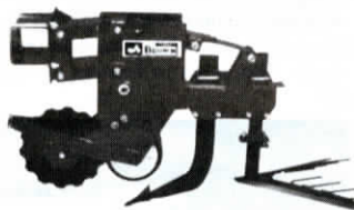
Spring-trip, gravity-reset mounting brackets allow both shank and sweep to trip over rocks and other obstructions.

"The sweeps, available in 30 to 40-in. widths, have 'sifting fingers' mounted on back set 3 in. apart. The fingers knock soil off weed roots for better weed control. By loosening some bolts, you can tilt the sweep