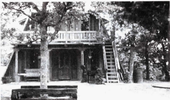
Tri-Steel has 200 dealers throughout the U.S. and Canada.

For more information, contact: FARM SHOW Followup, Tri-Steel Structures, Inc., 1400 Crescent, Denton, Tex. 76201 (ph 817 566-1386).