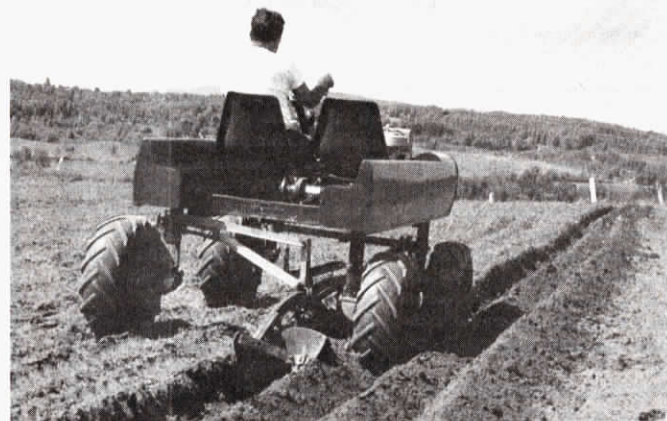
Quadtractor has 31 in. clearance and turns on a dime. Features airplane landing gear-type vertical drive on wheels.

For more information contact: FARM SHOW Followup, Traction Inc., P.O. Box 90, North Troy, Vt. 05859 (ph 802 988-4411).