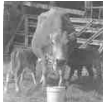
“Bessie”, a Chianina crossbred, first gave birth in 1985 to a single calf. Since then she’s had only twins - nine sets in a row.

from a calf. “I plan to keep her for at least two or three more years. Mothers of twin calves often can’t produce enough milk. But that hasn’t been a problem for Bessie.”