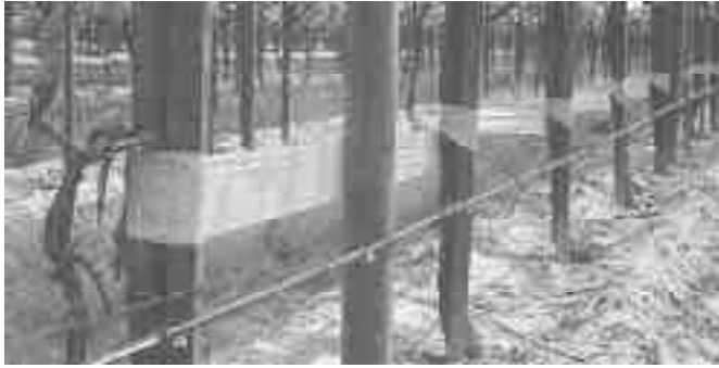
“Hopper Finder” is a 6-in. wide yellow UV plastic film that’s coated on both sides with adhesive. Can be used to trap any kind of leaf-sucking insect.