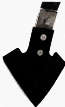
Extender mounts under shovel, adding 2 in. of length.

shank extenders and hardware needed to attach them. Units are specially designed to bolt tightly so shovels cannot work loose. The kit sells for $49.95.