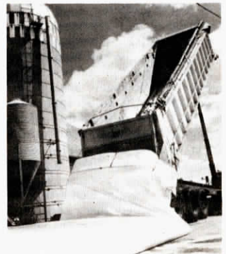
Bag feeds out automatically as load is dumped.

For more information, contact: FARM SHOW Followup, General Stor, 475 Randolph Ave., St. Paul, Minn. 55102 (ph 612 291-2642).