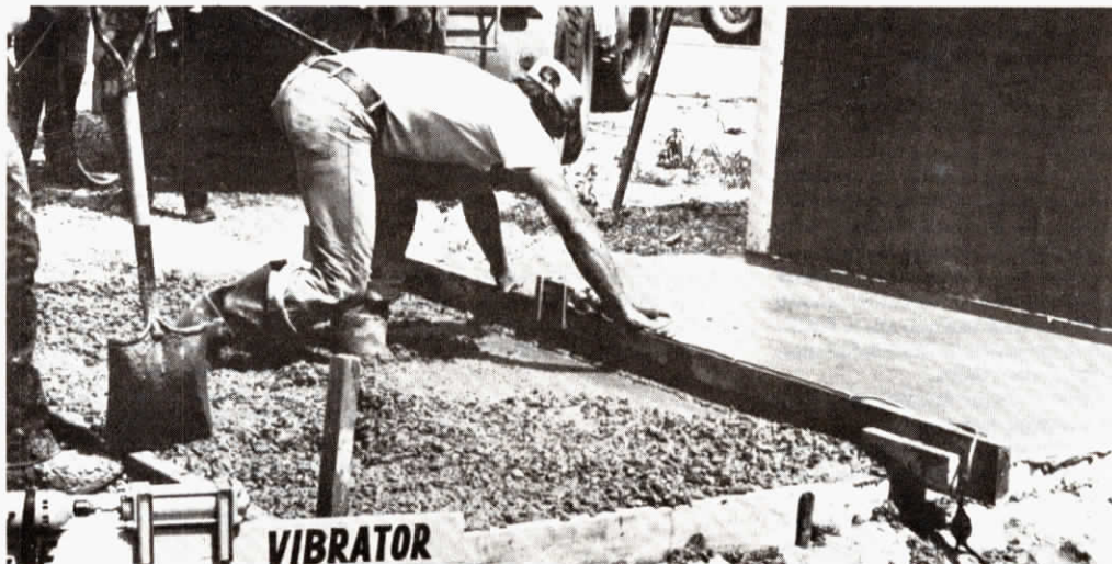
Photo shows how one man can level spans up to 20 ft. using the new Custom Vibe vibrator, shown on left. The device "walks" in the direction of the pull, allowing one man to strike the concrete by simply guiding the board.

For more details, contact: FARM SHOW Followup, Custom Trailers Mfg., 233 South State Street, Westville, Ill. 61883 (ph. 217-267-2127).