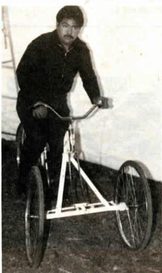
New axle bolts to bike frame.

For more information, contact: FARM SHOW Followup, Starr Machinery, P.O. Box 36, Del Rey, Cal. 93616 (ph 209 888-2204 or 896-5730).