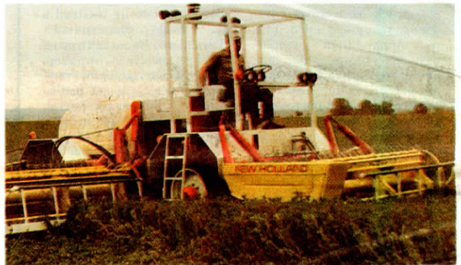
Spray attachments mounted on the front of each Haybine unit apply Pro-Cure, which dissolves wax on plant stems to speed drying.