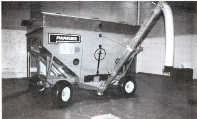
Kit consists of a double door, viewing ports on either side, an auger and hopper, and a plywood divider inside that splits the wagon in half.

Contact: FARM SHOW Followup, Unverferth Mfg. Co., Inc., Box 357, Kalida, Ohio 45853 (ph 800 322-6301 or 419 532-3121).