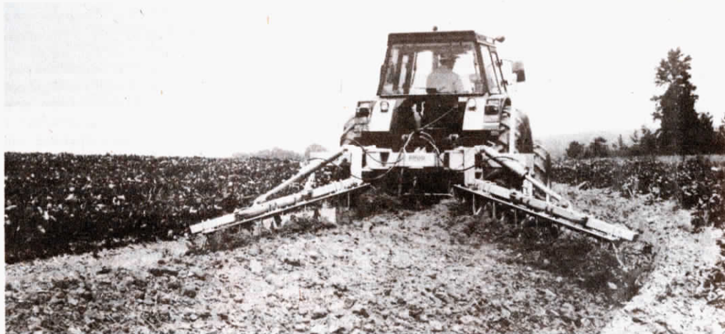
Two hydraulic cylinders control tilt angle of the two gangs on the go.

Basically, all the operator has to do is follow the surveyed SCS terrace line. By hydraulically changing the tilt angle of the gangs, terrace height is adjusted to SCS recommendations after a few passes. Weight of the