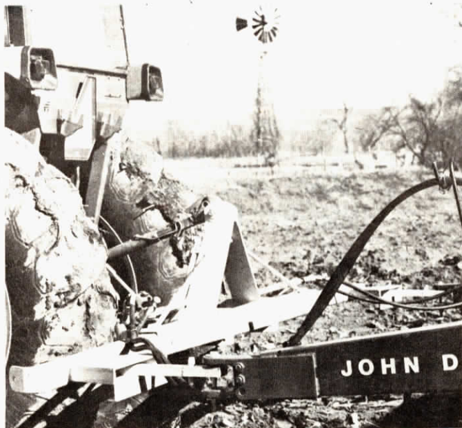
Telescoping hitch features two sliding drawbars that swing freely back and forth. Can be used to pull two 4-row or two 6-row planters, or to pull a 4-row and 6-row planter together.

For more details, contact: FARM SHOW Followup, John Shearer Disk Plows, C/O Austin Beringer, Australian Trade Commission, 1 Illinois Center, 11 East Wacker Drive, Chicago, Ill.