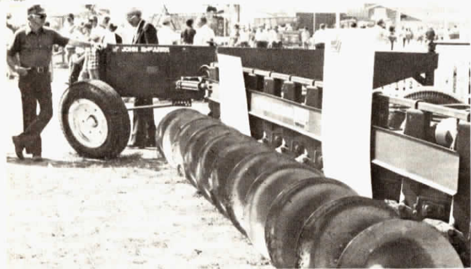
Shearer hydraulic disk plow pictured has 12 26-in. dia. disks spaced 12 in. apart. A prototype has 24 in. disks spaced 8 in. apart.