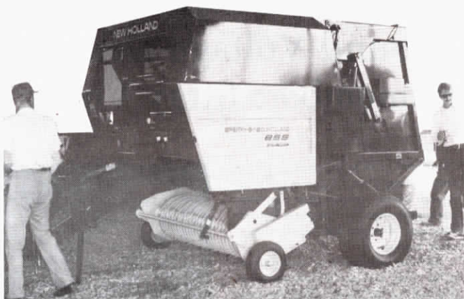
The new 855 makes 1,700 lb. bales 5½ ft. in dia. and 5½ ft. wide.