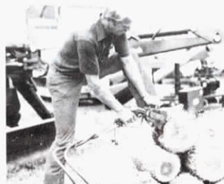
Saw weighs 8 lbs. and runs off tractor or truck hydraulic system.

Cost for the model with a 3 to 5 gpm flow rate, and a 12 in. cutting bar, is $725.