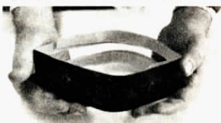
Chemical "predacides" are injected into depositories on either side of the collar.

"If you know there is a coyote problem in a certain area, you can put a few lambs with collars in with a flock of ewes and, when the coyote goes for the lambs, it'll be killed. A handful of collars can be used to protect large flocks of sheep," says McBride.