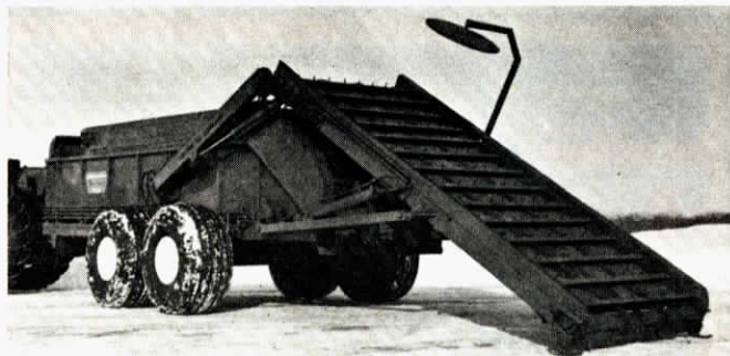
Apron loads manure down to within 2 to 3 in. of the ground. Overhead mirror lets operator monitor operation.

The "Wheelie Weigher", as the company calls it, can be left outside all year if antifreeze is added to prevent freezing in the colder climates. The company says farmers have been using the homemade weighers for everything from small animals to permanent installation in grain or mixing bins.