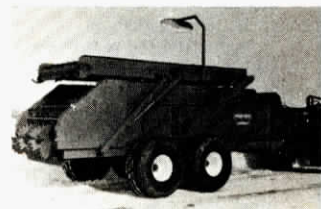
Apron folds up for transport and unloading.

The box itself is water tight, allowing it to haul anything from pure liquid to pure solid manure, and anything in between. The apron for the spreader itself goes under the box, up around the outside of the front endgate, and then inside where it goes down the endgate, across the bottom and to the back, exiting out the top of the rear endgate which slopes 45° to the rear.