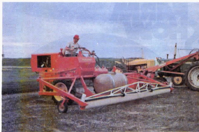
Quacker-Whacker — featuring 18 ft. long brush made of nylon carpeting — is mounted on Versatile 400 swather.

For a detailed information packet on how the machine operates, and cost calculations to help estimate its profit-making potential, send $2 and your name and address to: FARM SHOW Followup, Methods Manufacturing, 1363 Waterpark Road, Austin, Tex. 78758 (ph. 512 836-0929).