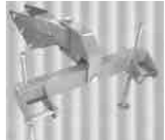
Hitch is designed for all wide and narrow quick couplers.

The hitch doesn't add length to the drill's tongue. Instead, it offsets the tractor from the drill's tongue when turning to provide