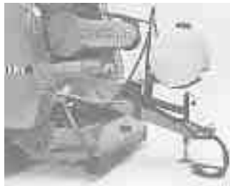
Add-on tube carries five or six rolls of twine or one roll of net wrap.

The 12-in. dia. sheet metal tube is 4 or 5 ft. long depending on baler model. It installs in about 20 minutes on mounting brackets that fit in two existing holes on the baler. Two more holes have to be drilled. It detaches quickly with two pins.