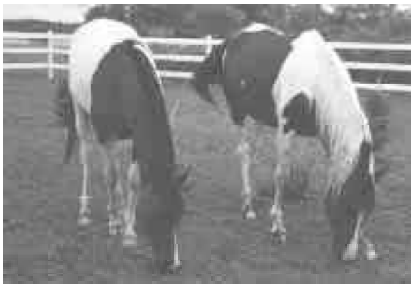
Pintabians have markings of Pintos, disposition of Arabians.

Winds, 290 East Pennsylvania Ave., P.O. Box 256, Roseville, Ill. 61473 (ph 309 426-2171; fax 2407).