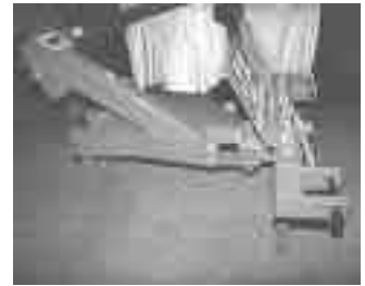
Adapter for drawbar-type hitches and dolly wheels.

To mount the drill you remove the drill's clevis and widen the hole on the tongue, then slip the original hitch pin through it. Another