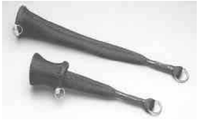
New nylon mesh pullers are gentler than chains, straps, or other devices.

Contact: FARM SHOW Followup, Terra Tech Industries, 1257 Lenox Ave., Pierson, Iowa 51048 (712 375-5465).