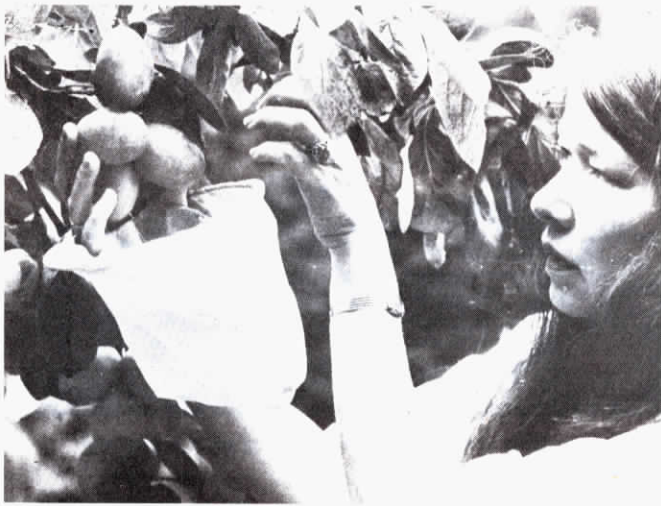
Picker-Pocket Bag adapts to right or left hand. Holds 1¼ qts. and is made of thorn-proof nylon.