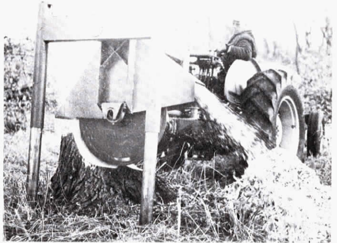
Stumpcutter handles stumps of any diameter up to 36 in. high.