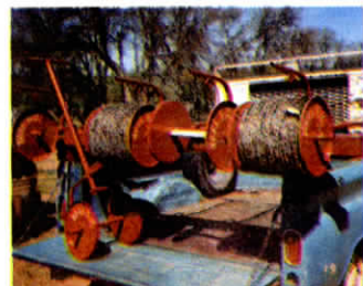
Wire reel mounts on 1-in. dia. steel handlebar.

“It’s a new way to do an old job. Makes it easy for one person to string fence wire,” says Chet Sunde. “You can unroll 500 to 600 ft. of wire in 5 minutes or less. We even offer a pickup or tractor 3-pt. mounted toolbar that’ll hold several Reel E-Z units at once so you can unroll as many as five strands of wire at a time.”