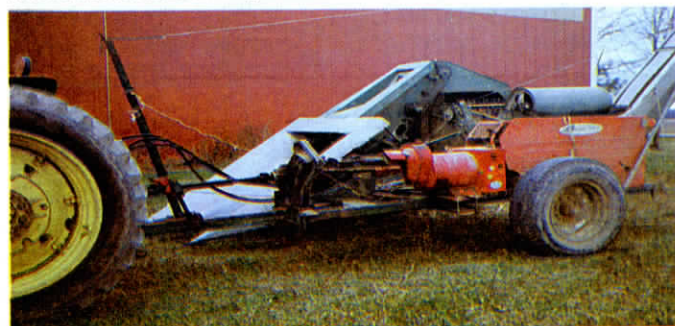
Pull-behind chopper is electric-powered by generator mounted on corn picker.

Contact: FARM SHOW Followup, Carl Schultheis, 2999 Van Geisen Rd., Caro, Mich. 48723 (ph 517 673-3409).