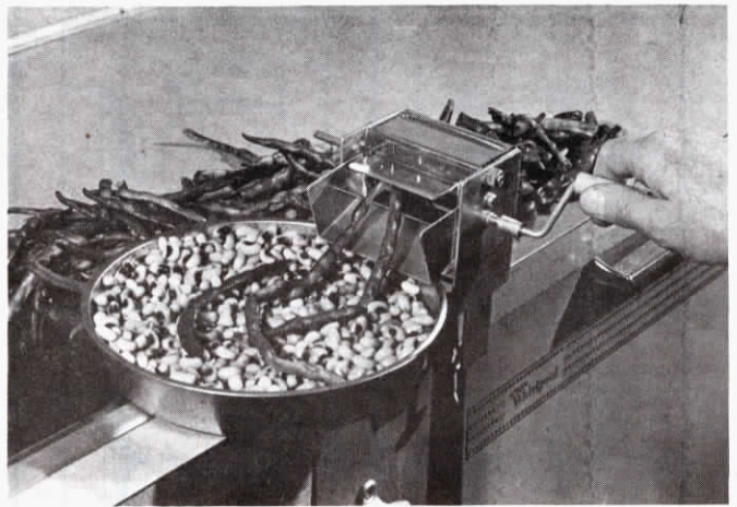
You can hook a portable electric mixer up to the drive shaft of the hand-crank pea sheller.

For more information, contact: FARM SHOW Followup, Mr. Pea Sheller, P.O. Box 29153-B, Dallas, Texas 75229.