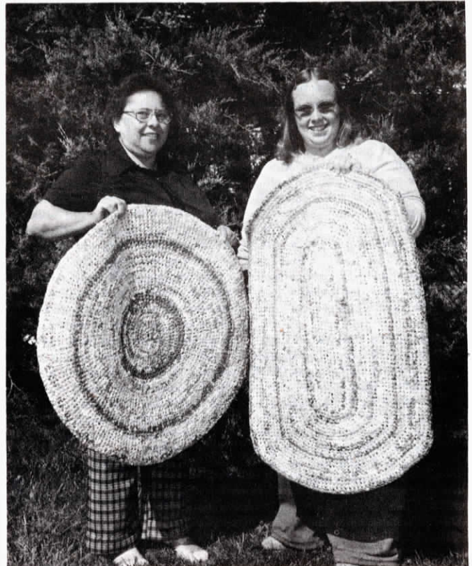
It takes 100 to 125 bread wrappers to make a 20 by 36 in. rug.

"The rugs also make excellent mats to use in front of the kitchen sink. The bread wrappers are comfortable to stand on as you do the dishes. They're also easy to clean. Just submerge the rug in warm, soapy water, then hang it on the clothesline to dry. Many owners tell me they've been using their bread-wrapper rugs for several years with no signs of wear, Freda told FARM SHOW.