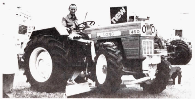
Blade tilt and lift is totally hydraulic on Anderson's new mid-grader.