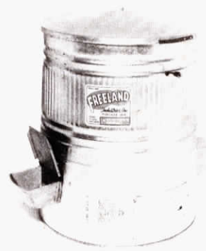
Freeze-proof, gravity flow fountain can also be hooked to pressure watering system.