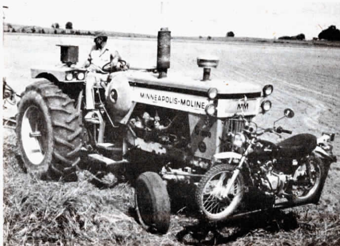
One end of the channel iron cycle carrier drops down to become a small ramp for loading.