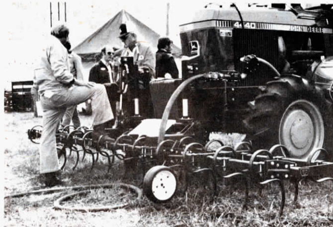
You can attach just enough tines to level the area covered by the tractor's rear tires, or you can use enough tines for up-front, secondary tillage.

About two weeks after installation, you return to give each Reel-Tite another crank to take out the slack. Once your fence is in shape, leave the Reel-Tites in place until the wire again needs tightening. Barbs on barb wire fence will work their way through the staples, if necessary.