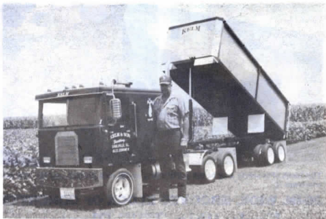
The 1/2-scale semi reminds a lot of people of a Peterbuilt or Kenworth cab-over.