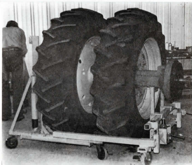
Dual tire adapter fits on Cofer's single tire cart, allowing one man to remove a set of duals with the final drive housing attached. Rated at 8,000 lbs. capacity.

For more details, contact: FARM SHOW Followup, Specialty Metal Fabricators, 1032 Chestnut, Minonk, Ill. 61760 (ph. 309 432-2586).