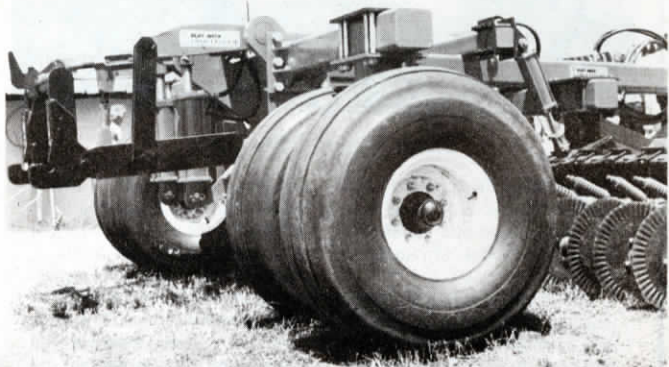
Ruff-Neck "Load Lugger" features 3-pt. hitch and auxiliary toolbar on which coulters or other attachments can be mounted to combine several operations into one. Chemical tank for pesticides or fertilizer can be mounted on top the unit.