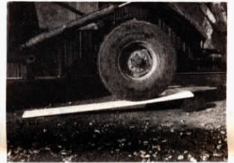
The 1/3-size tailgate is made from strong, 1/8-in. steel.

The Shortgate, which comes with universal mountings for any full-