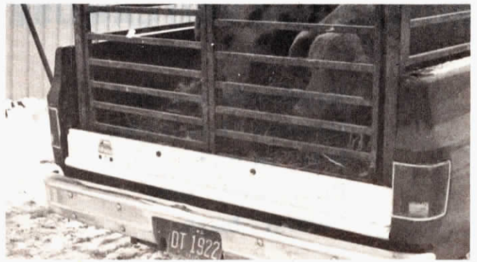
The new Shortgate is especially handy with livestock racks, says the manufacturer.