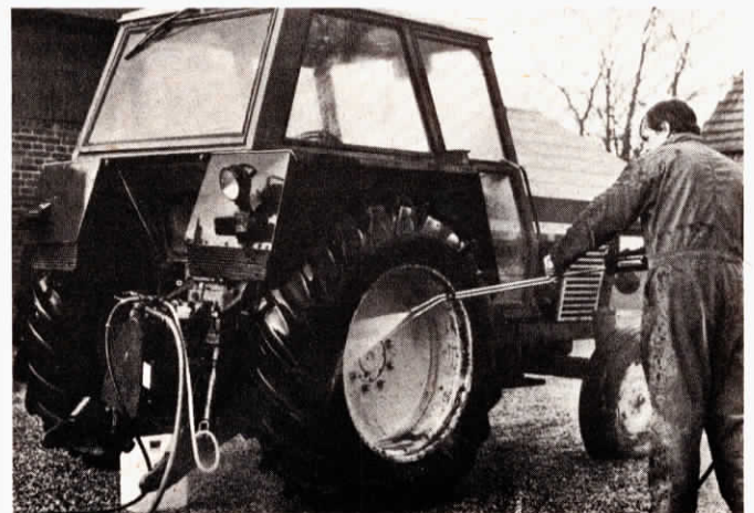
The new-style washer travels with you for “anywhere cleaning”.

For more information, contact: FARM SHOW Followup, Specialty Equipment Co., 7721 Pillsbury Ave. So., Minneapolis, Minn. 55423 (612 861-7491).