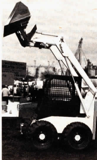
New-style bucket adds reach to a loader, as well as new angles for ground work.

For more information, contact: FARM SHOW Followup, Tink, Inc., Rt. 2, Box 4, Durham, Calif. 95938 (ph 916 895-0897).