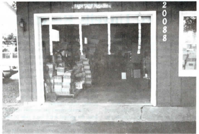
Photo illustrates how Bird Scat metallic strips hang from doorway to frighten birds.

Bearlift truck box lift: This just-introduced labor-saver provides remote hoist control for trucks equipped with single or double acting cylinders. The kit, priced at $695 for toggle switch control ($895 for push button wireless control), is designed for do-it-yourself installation. It includes a valve, cab control electrical switch and harness, a rear box-mounted electrical switch and harness, and fittings to connect into the truck's hydraulic system. The