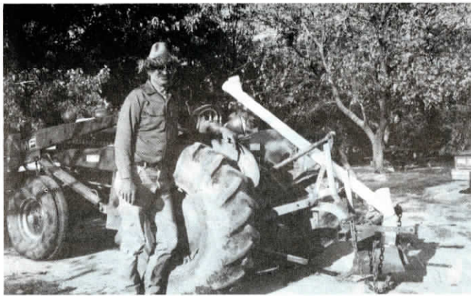
Krotz drops seeds down 3-in. dia. pvc seed tube mounted behind tractor seat.