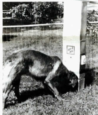
New feeder doesn't let pets overeat.

"Veterinarians agree that all pets will overeat if given the chance. The Feed-A-Meal dishes out pre-set daily portions of dry pet food at the same time every day, keeping animals on a