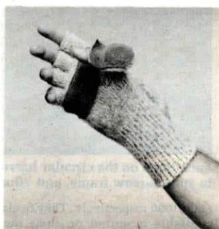
Mitten's flaps fold back to expose fingers.

For more information, contact: FARM SHOW Followup, McLean International Marketing, Inc., 1503 Paradise Drive, Burlington, Wis. 53105 (ph 414 763-9566).