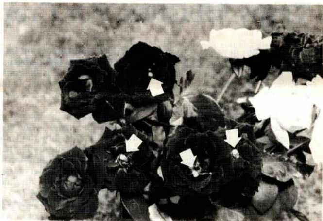
Arrows point to secret messages hidden in flowers.

For more information, contact: FARM SHOW Followup, Hart Industries, Inc., 25301 Cabot Road, Suite 212, Laguna Hills, Cal. 92653 (ph 714 951-4606).