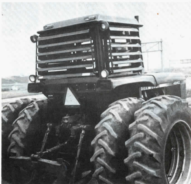
Lundell's Sunshades have adjustable louvers which mount 4 in. from window.

For more details, contact: FARM SHOW Followup, Lundell Mfg., Cherokee, Iowa 51012 (ph toll free 800 831-4841; Iowa residents dial 800 352-4639).