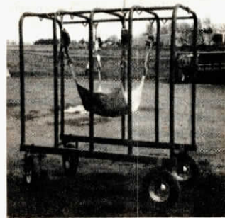
"Cow Mobile" fits into 42 in. wide stanchions.

For more information, contact: FARM SHOW Followup, Kobiske Industries, Inc., 300 Industrial Drive, Loyal Wis. 54446 (ph 715 255-8535).