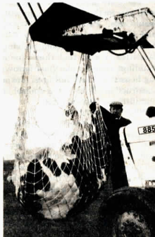
The 8 by 10-ft. lifting net looks like a king-size hammock.

For more information, contact: FARM SHOW Followup, Manus (Great Britain) Limited, Moreton-in-Marsh, Gloucestershire, Great Britain, GL56 0HJ (ph 0608 50836).