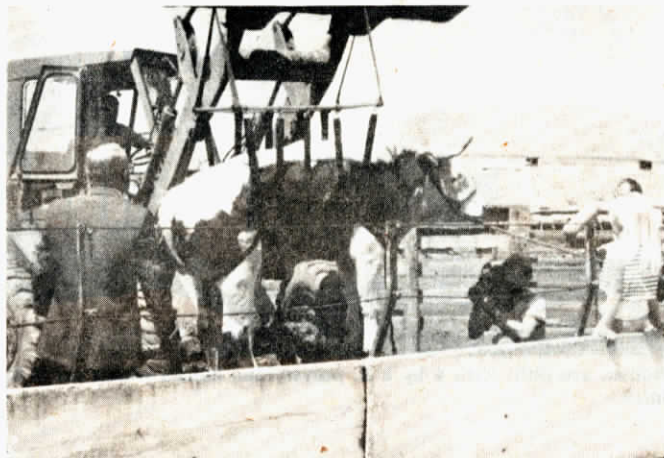
Sling can be used to lift hogs, horses, sheep or cattle.