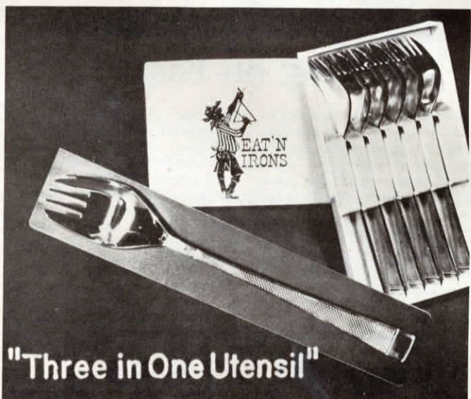
"Three in One Utensil" One stainless steel Eat 'n Iron does it all, serving as fork, knife and spoon.

For more details, contact FARM SHOW Followup, Sunshine International, Box 4518, Long Beach, Ca. 90804 (ph. 213 439-0871).