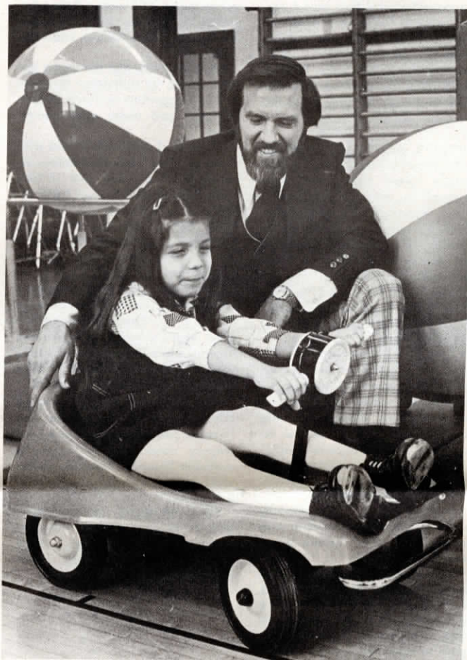
Rowcar's special steering mechanism, similar in principle to a railroad handcar, is self propelled by a "rowing" bar. Simple arm movements propel Rowcar backwards, forward, right and left.