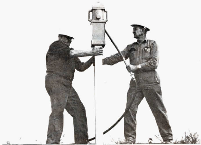
Rhino air-driven post driver delivers up to 1700 blows per minute. One moving part, a reciprocating piston, strikes directly on the post hole driving adapter.