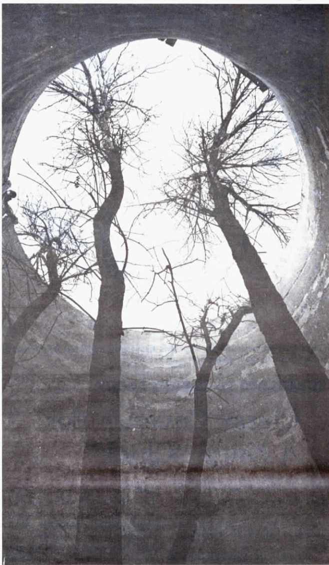
Stretching to reach the sun, these four Hackberry trees have grown about 10 ft. above their 30 ft. silo home.