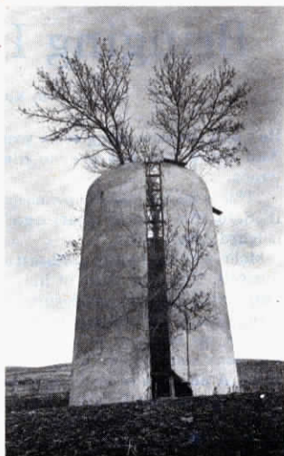
Silo has protected the trees from storms for more than 25 years.

The trees sprouted and took root on their own. Billy Juhnke, a life-long resident of rural Milltown, recalls first noticing the trees growing inside the silo in 1954 when he was hunting. Through the years, the silo has protected the growing trees from wind and weather, and has also sheltered them from direct sunlight. Apparently, lack of sunlight didn't hinder their growth. They kept growing inside the silo until their tops reached beyond the top of the silo.