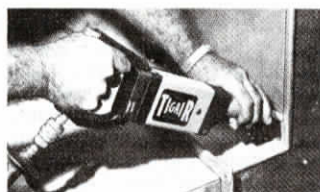
The air-powered Tigair cuts with a 1 3/4 in. stroke, taking up to 1,200 strokes per min.

He adds that the Tigair is safe and non-sparking, and has a self-lubricating system which automatically oils all moving parts, including the blade. Complies with OSHA stand-