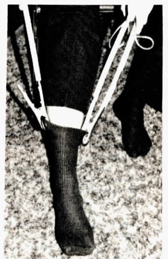
To use, attach the clamps to each side of sock opening, then pull sock over your foot. You release the clamps using a wooden rod which slides into the second arm of the clamp.

For more information, contact: FARM SHOW Followup, Rielyn Prosthetic Equipment, P.O. Box 852, Oakville, Ont. L6J 5C5 (ph 416 845-8872).