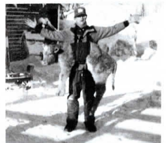
Funk patterned calf carrier after "papoose"-type infant carriers.

to carry the apron has 4 pockets to carry cartags, dehorning paste, vaccines, syringes, and other small items.