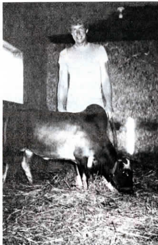
This 3-year-old mini Zebu bull stands only 33 in. high.

Mini Zebus are slow to mature. Males often aren't able to breed until they're almost