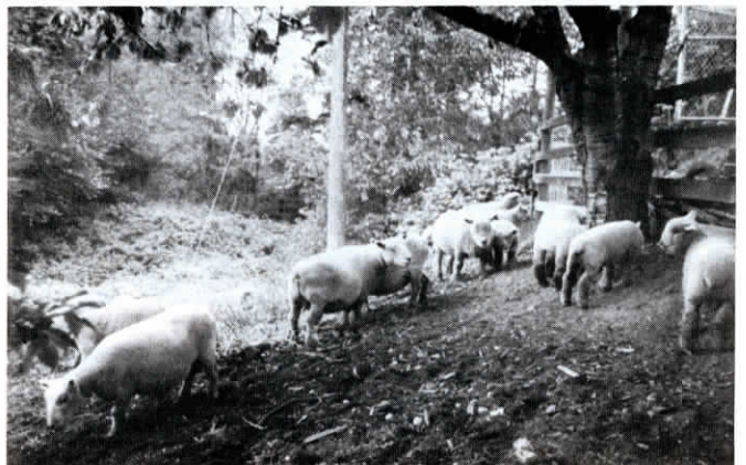
"Baby Doll" Southdown rams are no more than 26 in. high without wool and ewes no more than 24 in. high. There are less than 80 in the U.S.